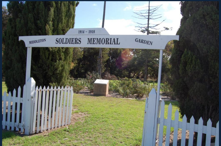
Image 6 The entrance to the Middleton Soldiers Memorial Gardens 1914-1918.