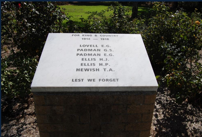
Image 7 The Memorial Tablet in the Middleton Soldiers Memorial Gardens showing the casualties of World War One.