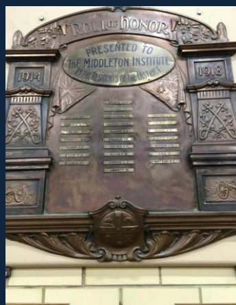
Image 9 The Honour Roll in the Middleton Community Hall that records the names of the local men who served in World War One.