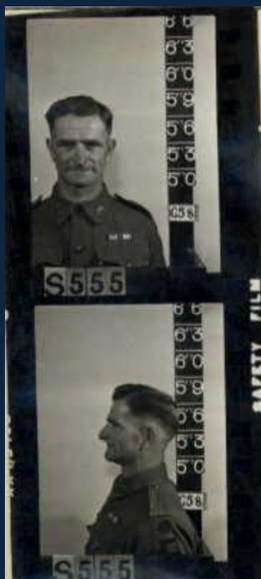
Image 4 Taken during his enlistment for service in WW2.