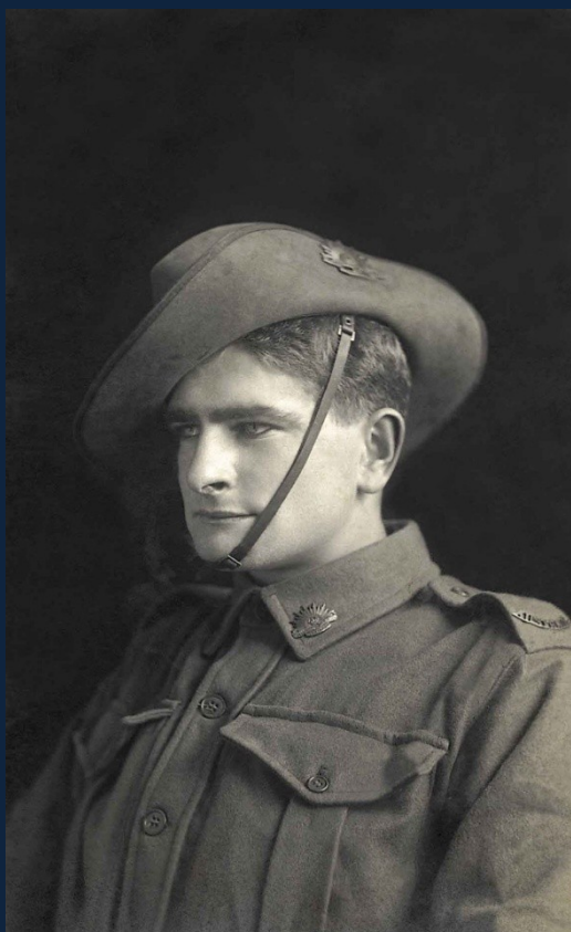
Image 2 Taken prior to his embarkation, Cliff would have been 18 years old .