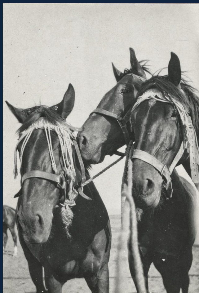
Image of horses of the 3 rd Light Horse Regiment Egypt 1914