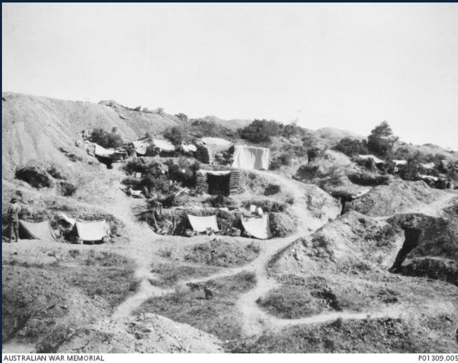
Image 6 Image of Gallipoli in 1915, these are the dug outs created by the 6 th Light Horse Regiment in 1915, this is just a reference image to show the conditions faced by the troopers and how open these dug outs were. Richard would have been trying to trying to hold the line in these dug outs.