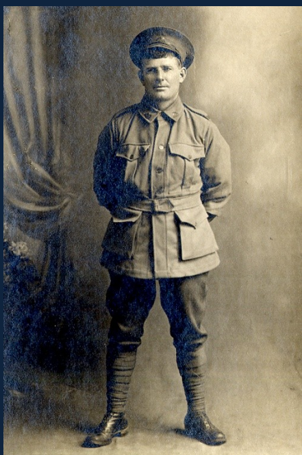
Image 1©www.archives.sa.gov.au 2009 circa 1916 digital image was purchased from the South Australian Archives.