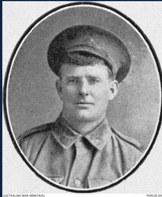
Image 4 The war cemetery La Plus Douve Farm Cemetery.