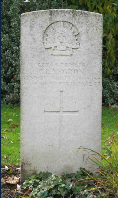
Image 2 Pte Langdon's grave at the war cemetery La Plus Douve Farm Cemetery in Belgium