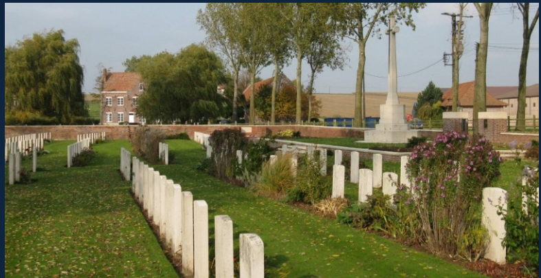
Image 3 The war cemetery La Plus Douve Farm Cemetery.