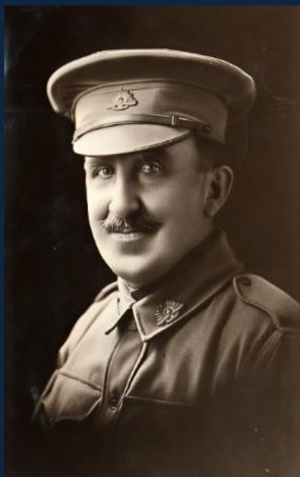
Image 1 © slsa.sa.gov.au circa 1916 Studio portrait rights purchased from the State Library of SA Archives. 2012